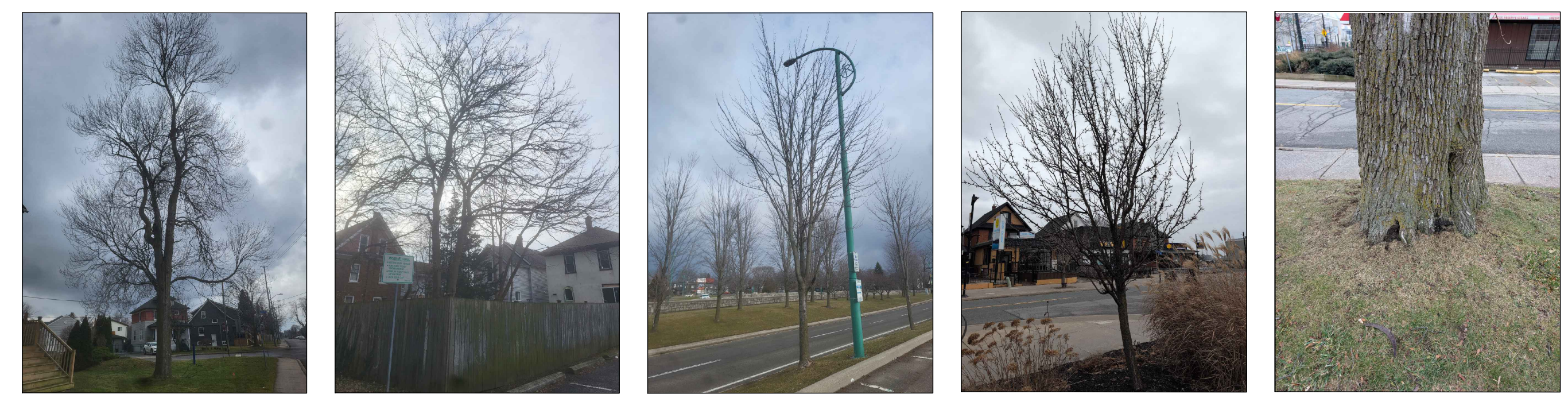
Tree #1 Tree #4 Tree #11 Trees #25 Trees #27

69 John Street South, Suite 250 Hamilton, ON L8N 2B9 t: 905.535.8976 e: info@adessodesigninc.ca www.adessodesigninc.ca