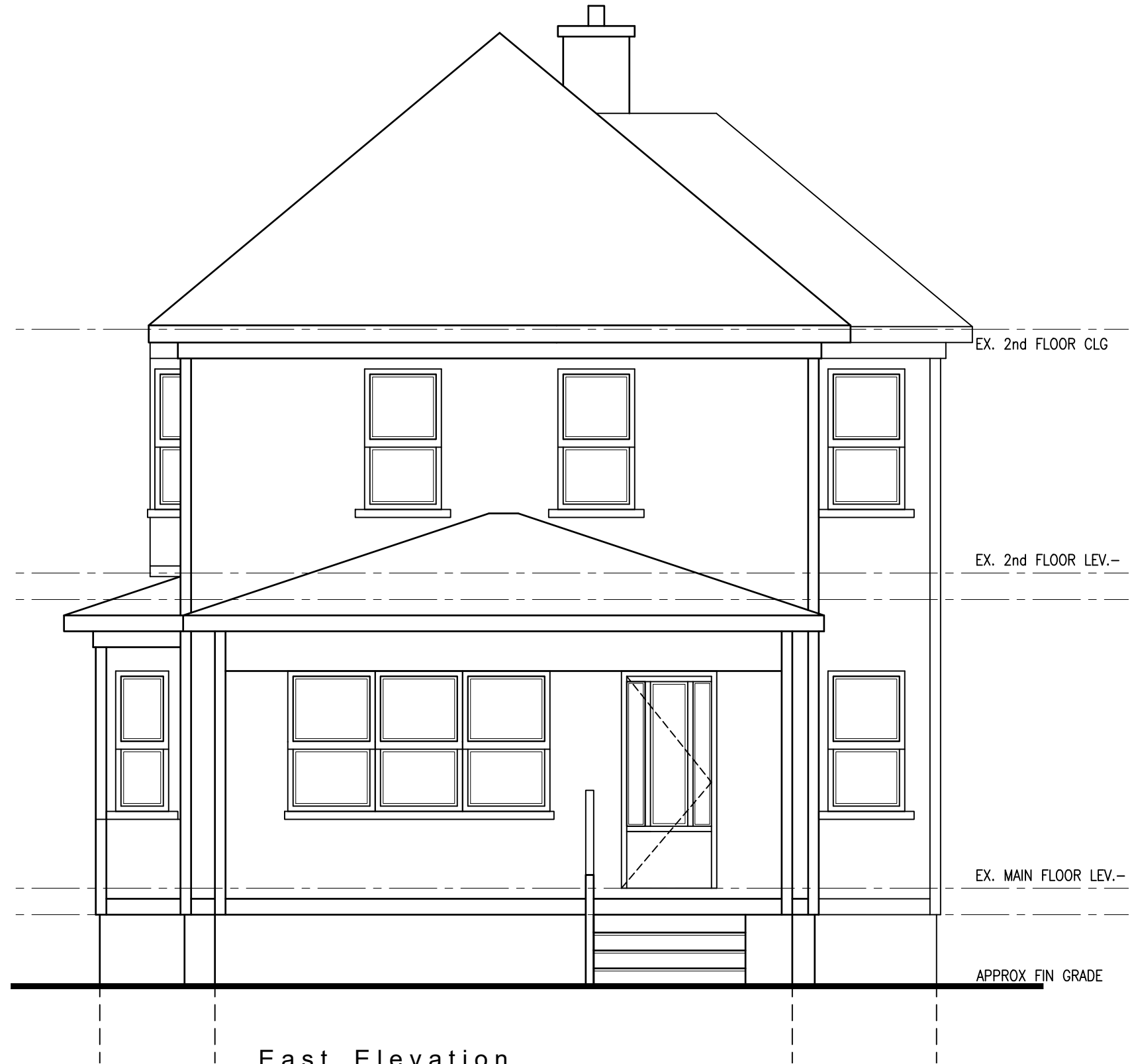
East Elevation FACING HUNTER STREET