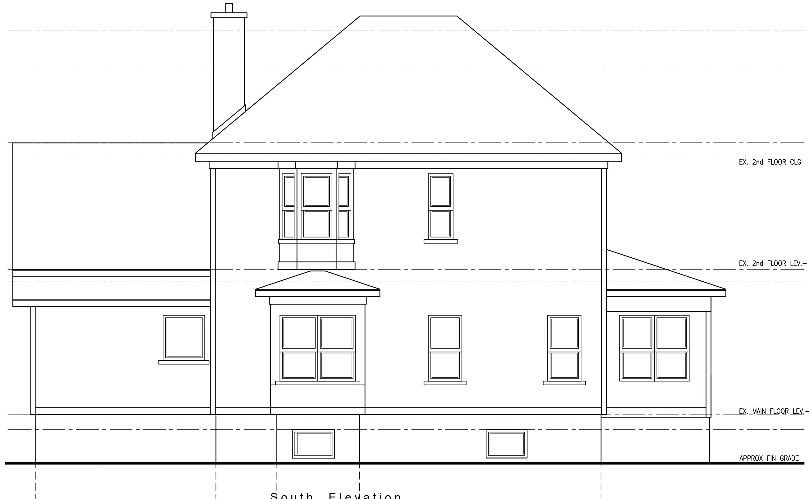
South Elevation LEFT SIDE VIEW