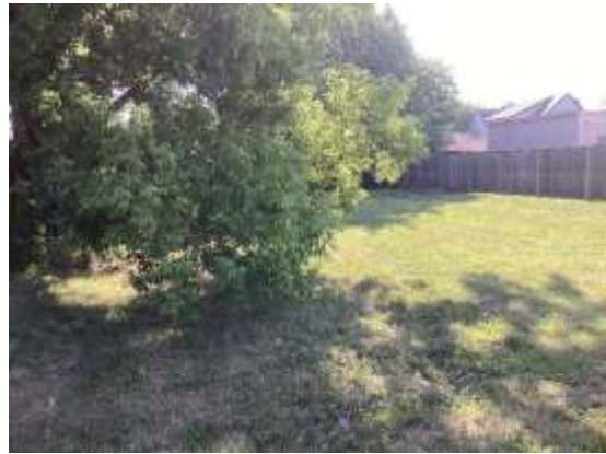
Photo 2: Manicured lawn, Test Pit Surveyed at five-metre intervals, looking east