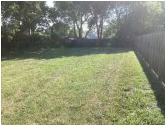
Photo 1: Manicured lawn, Test Pit Surveyed at five-metre intervals, looking east