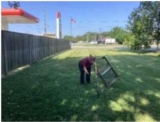
Photo 3: Manicured lawn, Test Pit Surveyed at five-metre intervals, looking west