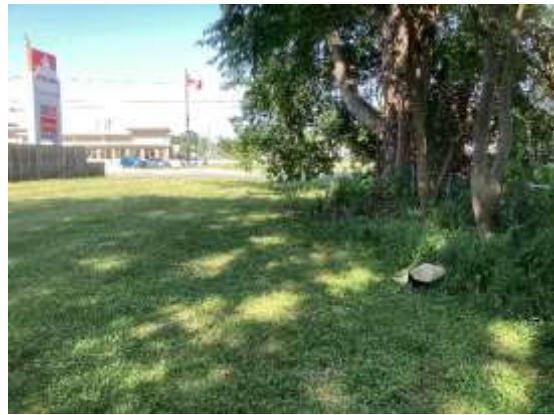
Photo 4: Manicured lawn, Test Pit Surveyed at five-metre intervals, looking west