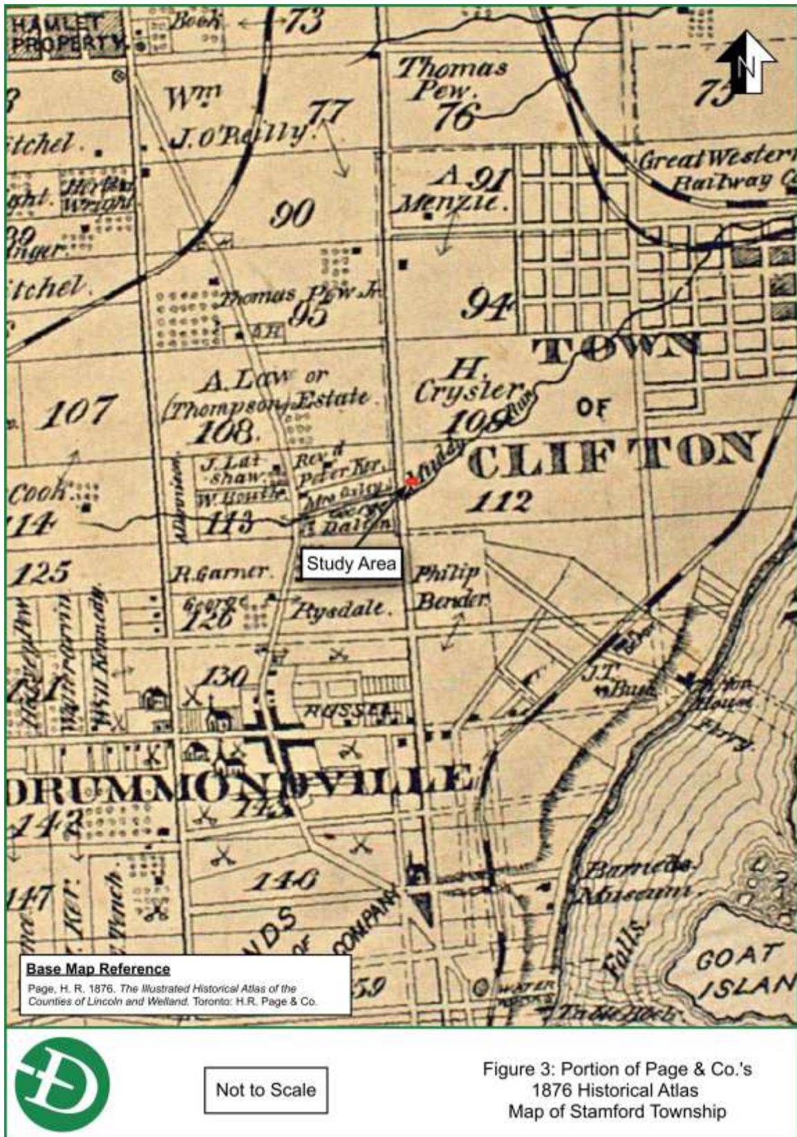
Figure 3: Additional Historic Map Showing Study Area Location