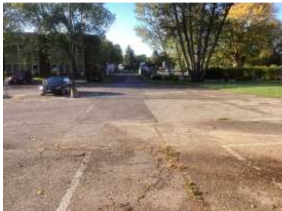
Photo 14: Asphalt parking area, Previously Disturbed, looking south