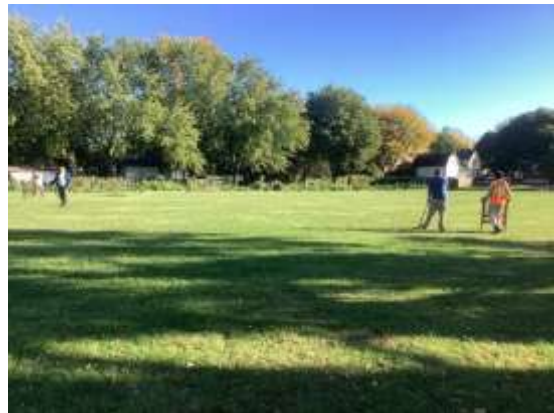
Photo 20: Manicured lawn, Test Pit Surveyed at five-metre intervals, looking northeast