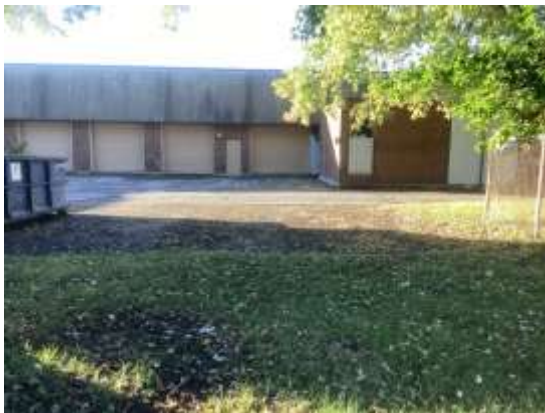
Photo 13: Manicured lawn, Test Pit Surveyed at five-metre intervals, and asphalt parking area and church building, Previously Disturbed, looking south