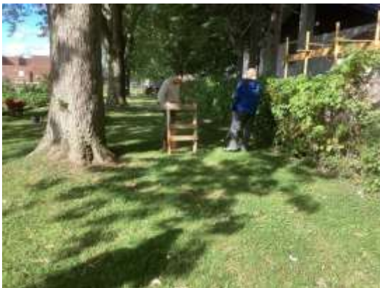
Photo 21: Manicured lawn, Test Pit Surveyed at five-metre intervals, looking west