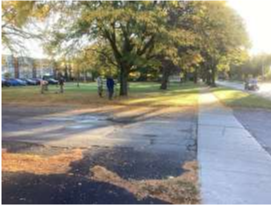
Photo 1: Manicured lawn, Test Pit Surveyed at five-metre intervals, asphalt driveway and cement sidewalk Previously Disturbed, looking east