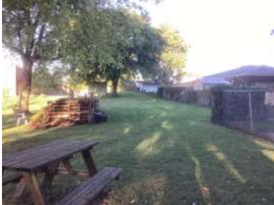
Photo 11: Manicured lawn, Test Pit Surveyed at five-metre intervals, looking northwest