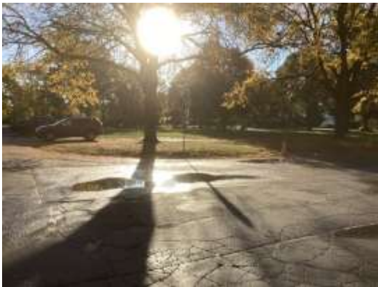
Photo 19: Asphalt parking area, Previously Disturbed, looking southeast