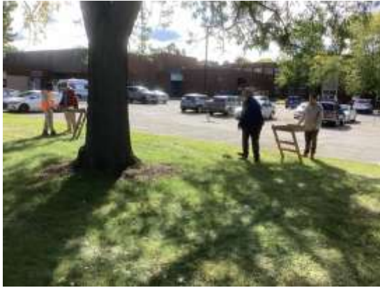
Photo 23: Manicured lawn, Test Pit Surveyed at five-metre intervals, and asphalt parking area, Previously Disturbed, looking southeast