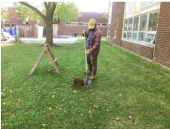
Photo 25: Manicured lawn, Test Pit Surveyed at five-metre intervals, and church building, Previously Disturbed, looking east