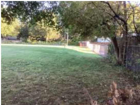
Photo 7: Manicured lawn, Test Pit Surveyed at five-metre intervals, looking north