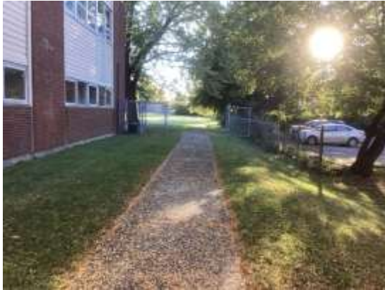
Photo 5: Manicured lawn, Test Pit Surveyed at five-metre intervals, church building and cement sidewalk Previously Disturbed, looking east