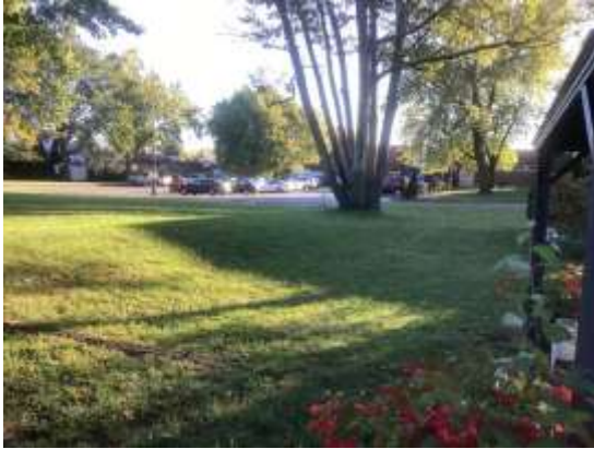
Photo 17: Manicured lawn, Test Pit Surveyed at five-metre intervals, looking northeast