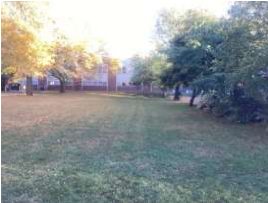
Photo 3: Manicured lawn, Test Pit Surveyed at five-metre intervals, looking north