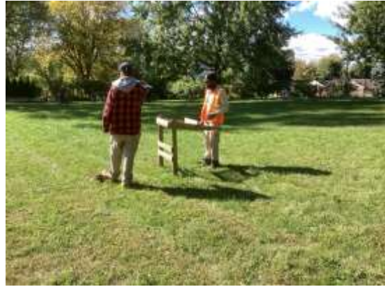
Photo 24: Manicured lawn, Test Pit Surveyed at five-metre intervals, looking southwest