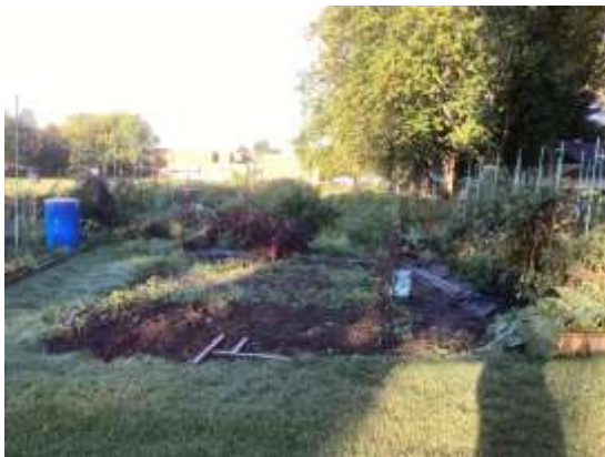
Photo 9: Manicured lawn and community garden, Test Pit Surveyed at five-metre intervals, looking west