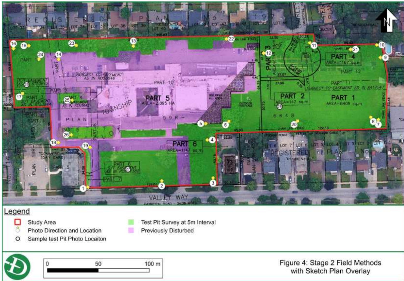
Figure 4: Stage 2 Field Methods Map and Survey Sketch