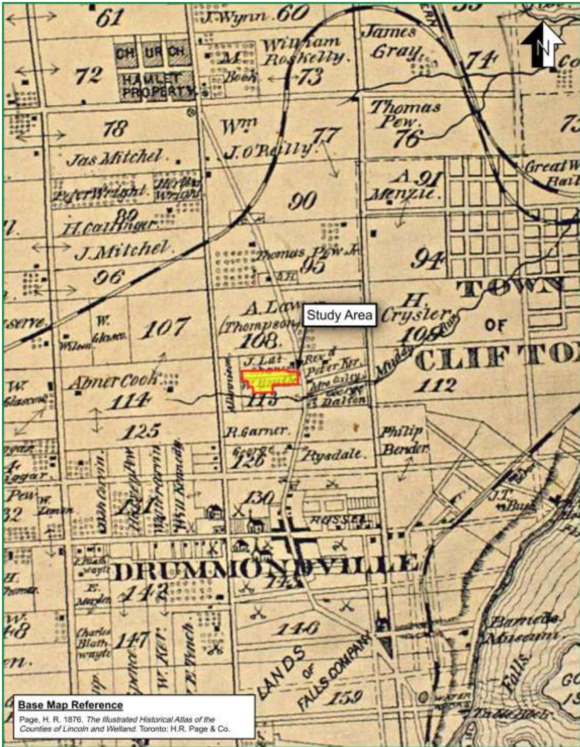
Figure 3: Additional Historic Map Showing Study Area Location