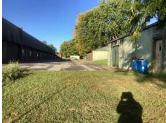
Photo 12: Manicured lawn, Test Pit Surveyed at five-metre intervals, and asphalt parking area, church building and storage buildings, Previously Disturbed, looking west