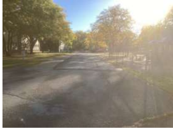
Photo 18: Asphalt parking area, Previously Disturbed, looking east