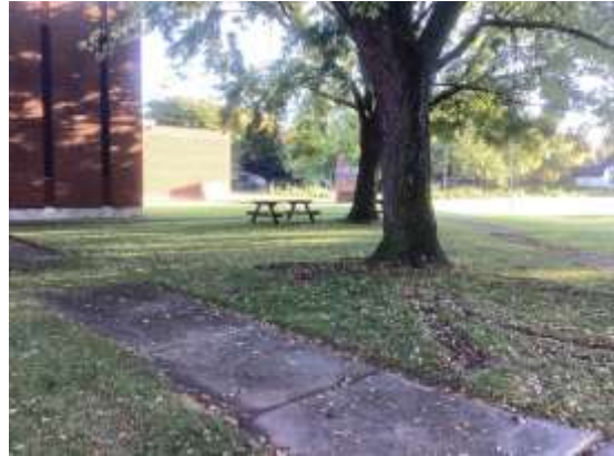
Photo 6: Manicured lawn, Test Pit Surveyed at five-metre intervals, church building and cement sidewalk Previously Disturbed, looking northeast