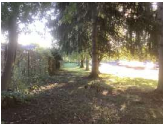
Photo 15: Manicured lawn, Test Pit Surveyed at five-metre intervals, looking east