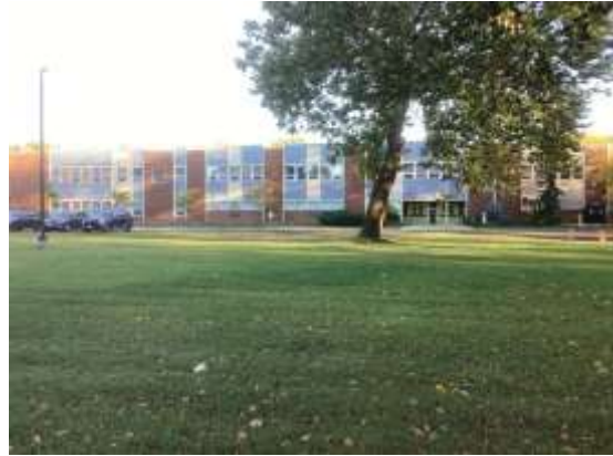
Photo 2: Manicured lawn, Test Pit Surveyed at five-metre intervals, church building, Previously Disturbed, looking north