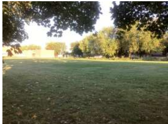
Photo 8: Manicured lawn, Test Pit Surveyed at five-metre intervals, looking northwest