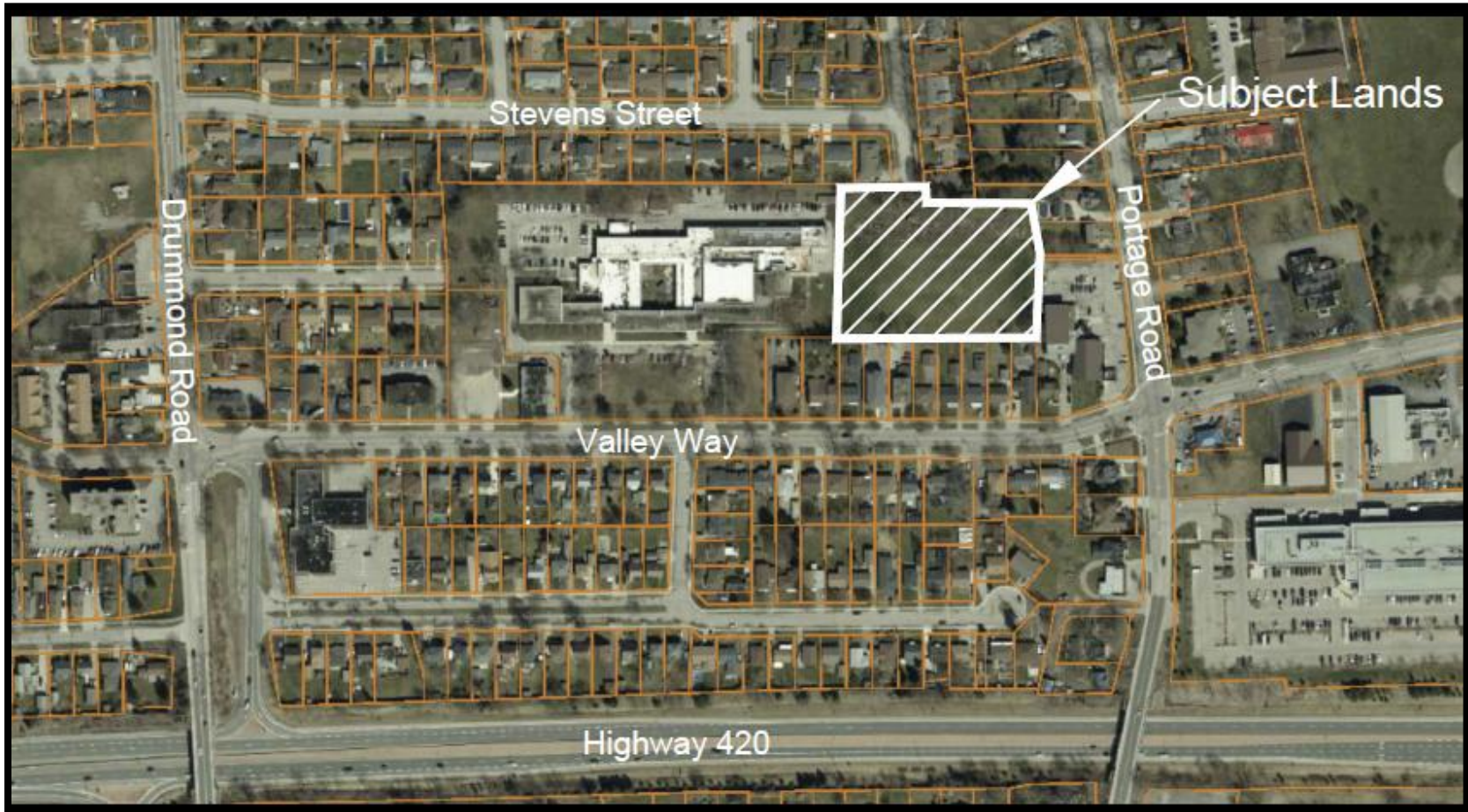
FIGURE 1 KEY MAP